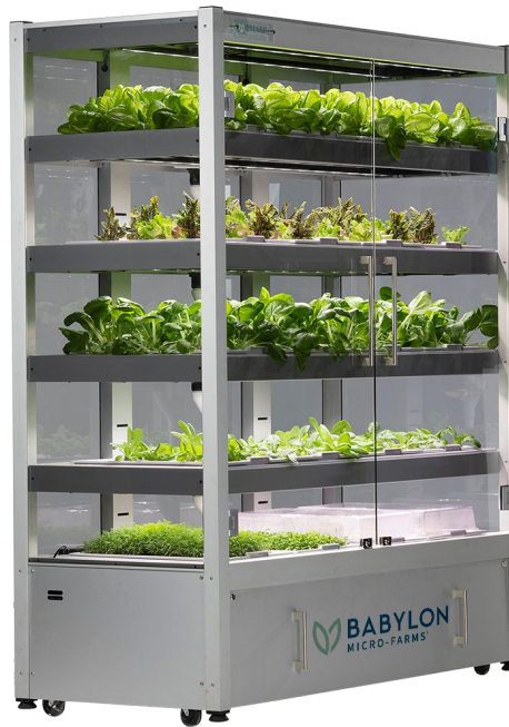
GALLERI Available Now!