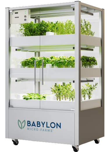
STEM Garden (Coming Summer 2024)